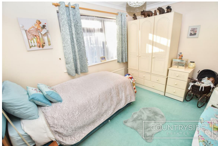
Window to rear, radiator, coved and artex ceiling.