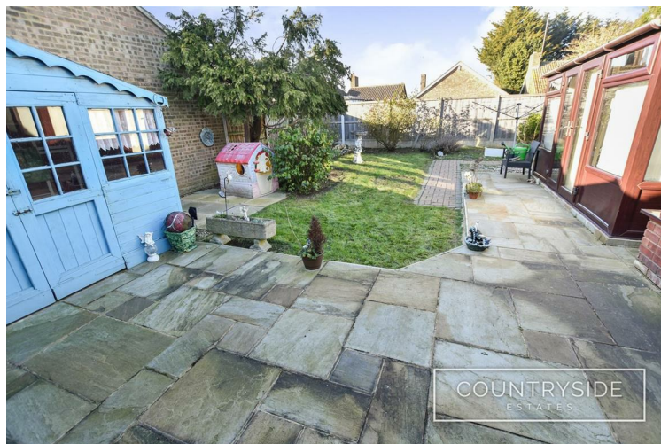
Unoverlooked West backing garden with attractive patio area, lawned, flower beds, side entrance gate leading to driveway.