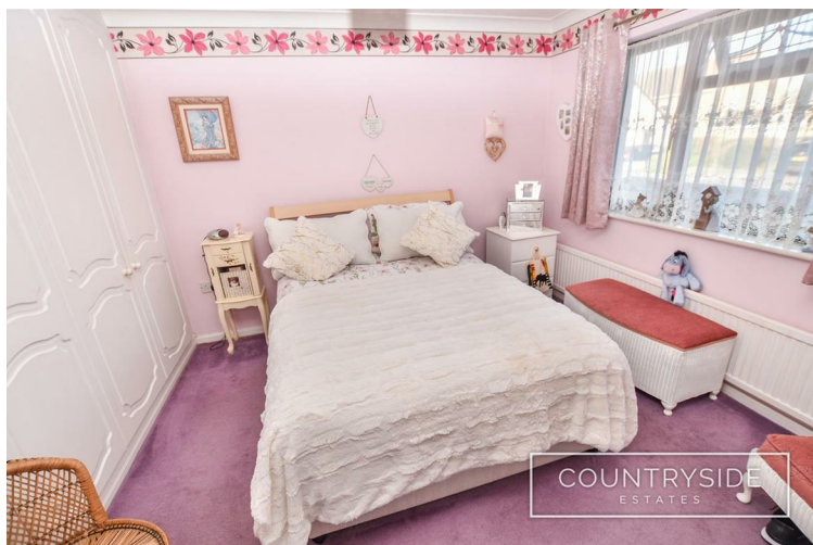
Window to front, radiator, coved and artex ceiling, two double floor to ceiling fitted wardrobes.