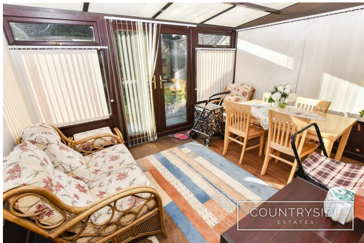
Windows to side and rear and French doors to garden, air conditioning unit.