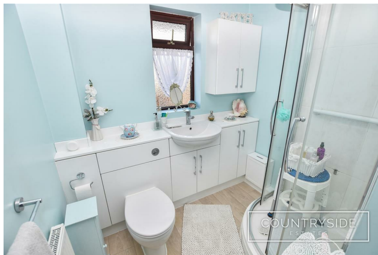
Window to front, radiator, fully tiled corner curved shower cubicle with electric shower unit, close coupled wc with concealed cistern and push button control, vanity wash hand basin with cupboards under, double base and wall cupboards, wood laminate flooring, artex ceiling.